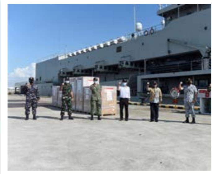
Indonesia Partnerships with multiple government agencies in Indonesia for the distribution of essential items and equipment to support recovery efforts in Indonesia