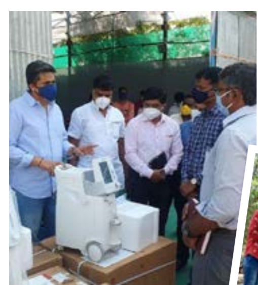
India Surgical masks and medical equipment were distributed to hospitals in Maharashtra and other states in India through the Ministry of Public Health and Family Welfare, India