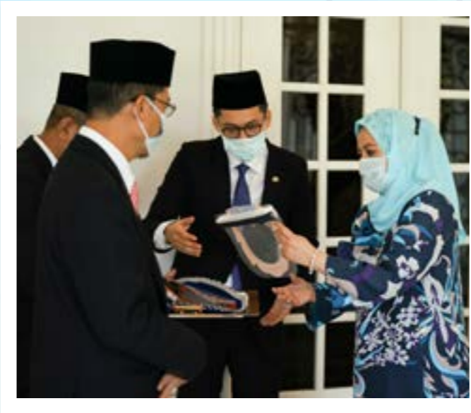
Malaysia Face shields for children and reusable masks will be distributed to various Johor districts through the Raja Zarith Sofiah of Johor Foundation