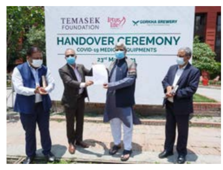
Nepal Diagnostics such as test and swab kits, and oxygen concentrators were transported to Nepal to support their testing and treatment efforts

Medical equipment and diagnostics were provided to hospitals and healthcare institutions to provide treatment and care for those affected by the virus, while masks and hand sanitisers helped frontliners and the community to stay protected.