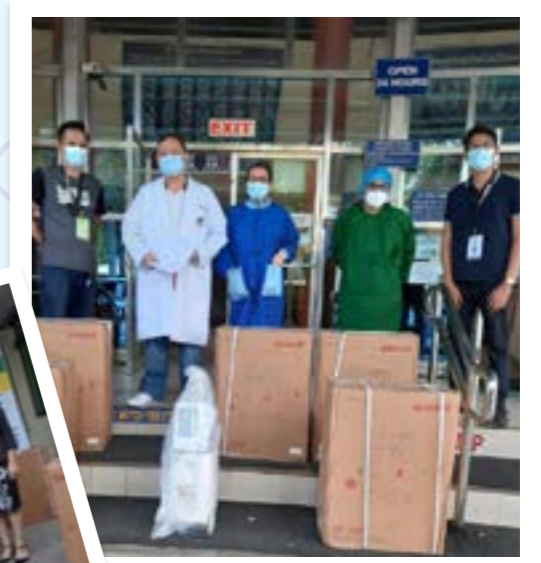
Philippines Handover of essential medical equipment to hospitals in Davao, Philippines